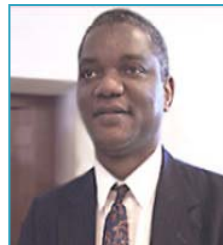
Adeniyi Stevens institute