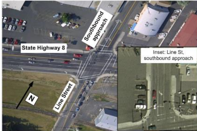
Figure 1. Aerial photograph of State Highway 8 and Line Street

In this activity, you will consider two cases, each illustrating a different method for the termination of phase 4 (which serves the SB through/right turn movements). You will observe how the phase times (the timing processes for the Minimum Green, Vehicle Extension, and Maximum Green timers), and how it terminates for each case. The two cases have been placed side-by-side in a movie format so that you can observe the traffic flow and timing processes at the same time. The simulation has been set to run at less than real time, slow enough so that you can observe all timing and traffic flow processes.