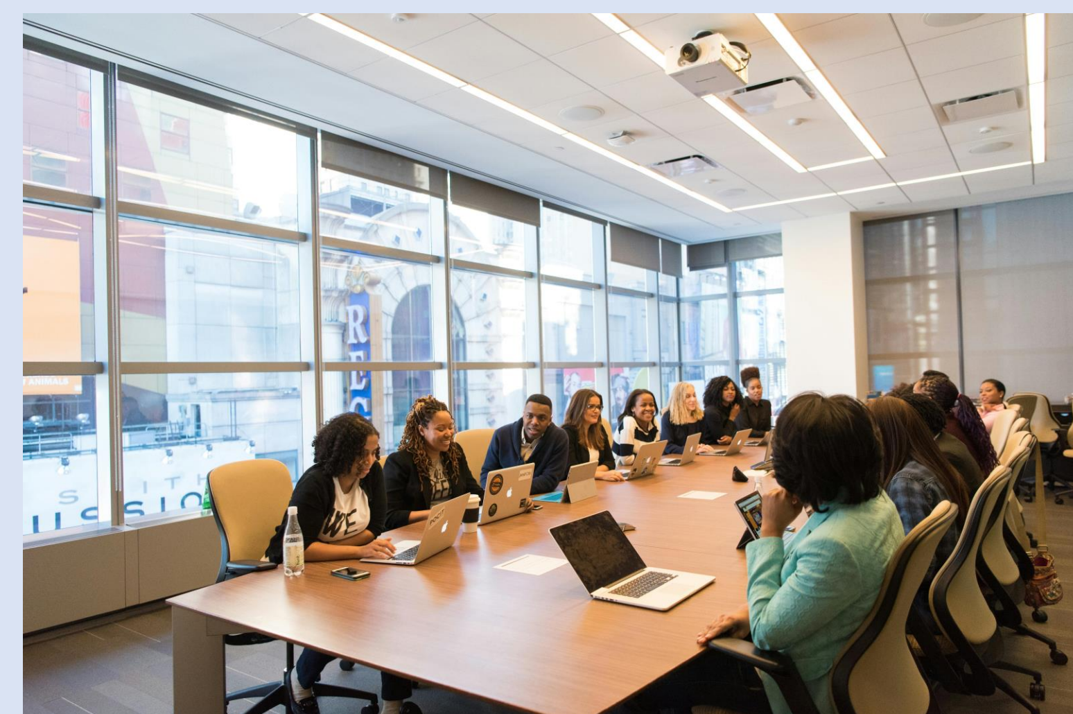
Instructional Design Workshop